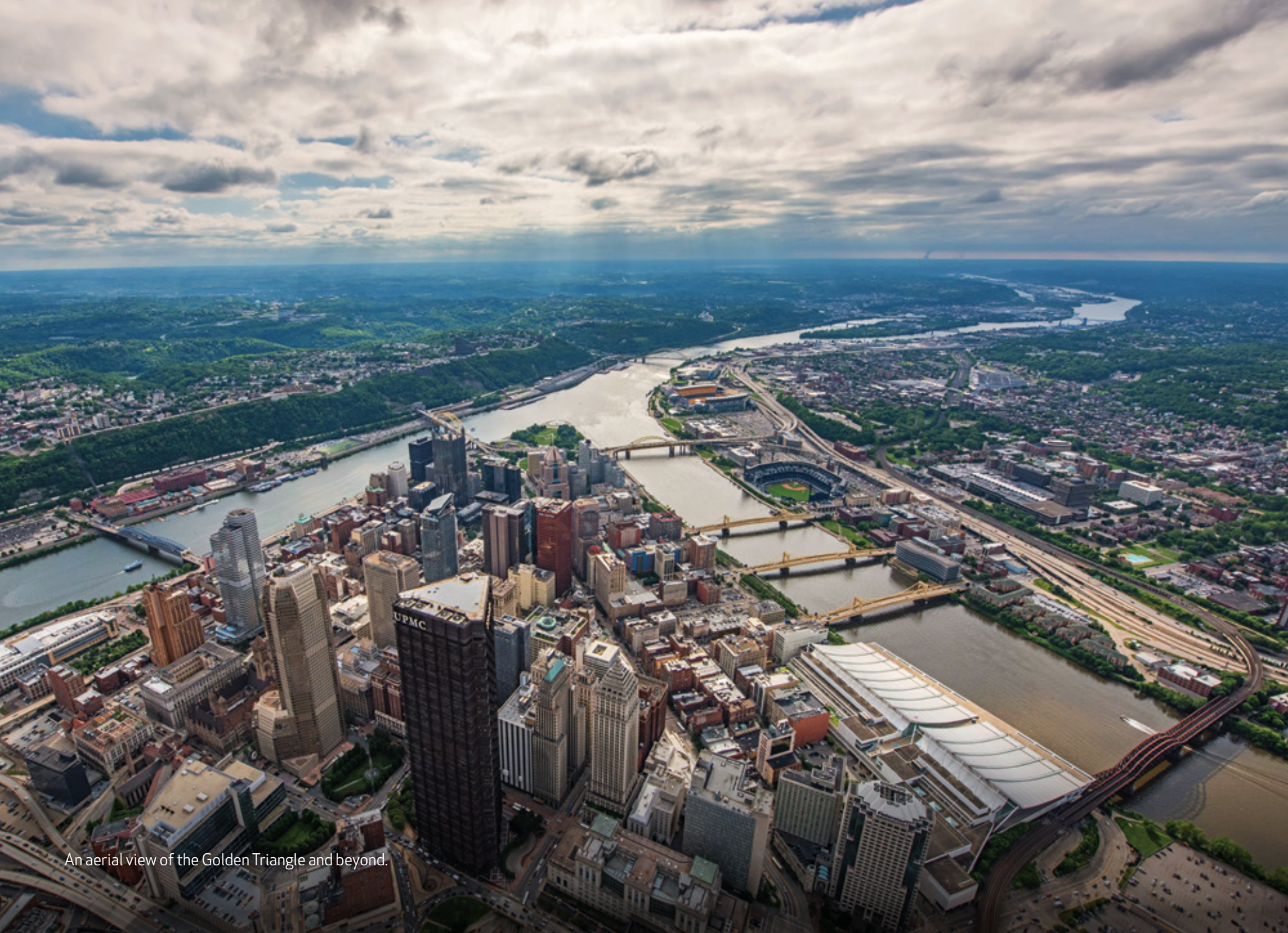
An aerial view of the Golden Triangle and beyond.