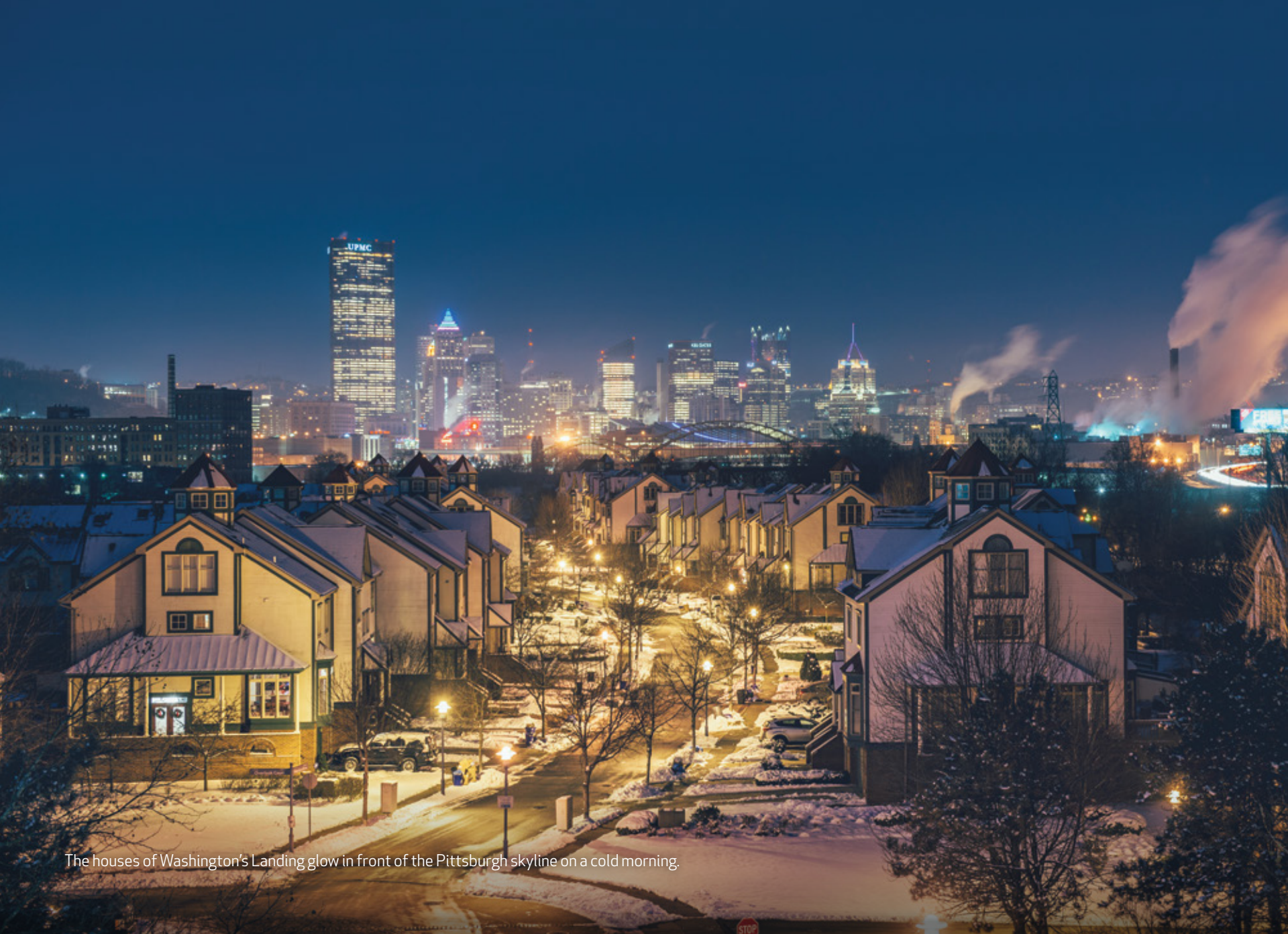
The houses of Washington's Landing glow in front of the Pittsburgh skyline on a cold morning.