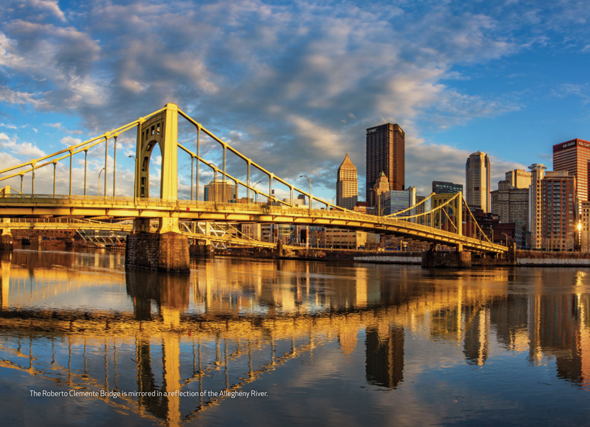
The Roberto Clemente Bridge is mirrored in a reflection of the Allegheny River.